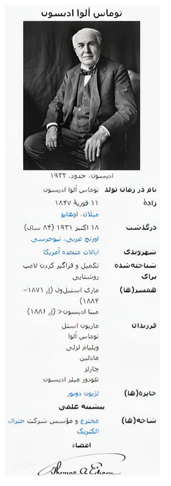
Fig. 2. Wikipedia infobox of "Thomas Edison"

the ability to execute queries, the ability to store metadata, having a graphical interface, and having rich libraries. An example of stored data shown in Fig 3.