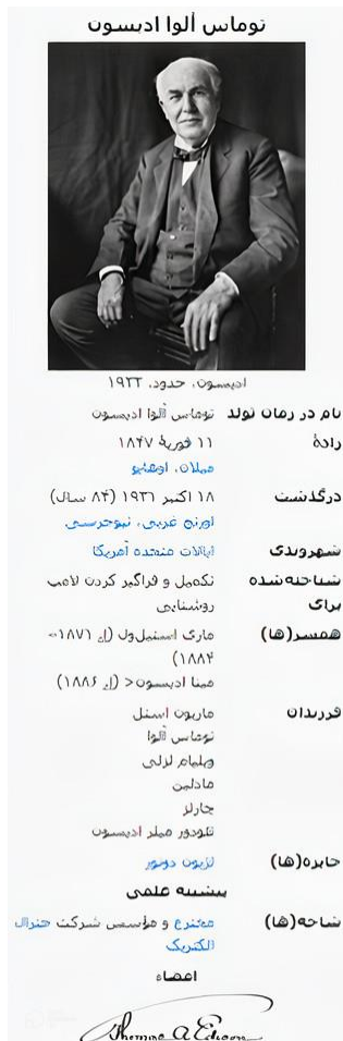
Fig. 2. Wikipedia infobox of “Thomas Edison”

the ability to execute queries, the ability to store metadata, having a graphical interface, and having rich libraries. An example of stored data shown in Fig 3.